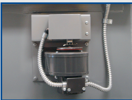
Forced Draft for Burning Coal Standard