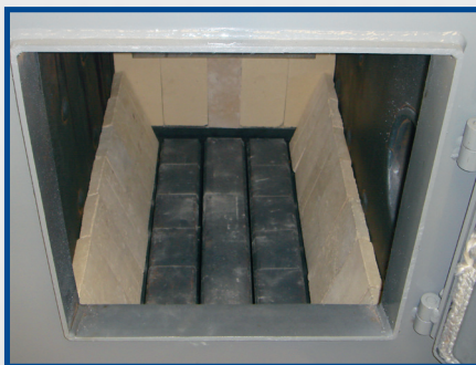
Rolla-Grate™ and Fire Brick Standard

See inside for complete list of standard features