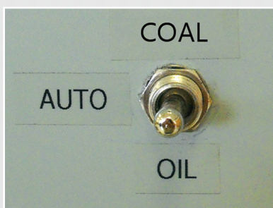
Auto Switch Over Optional on CO models