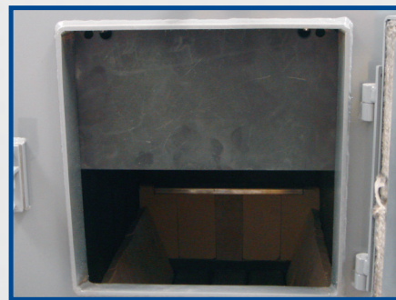
Load Door Smoke Flap Standard