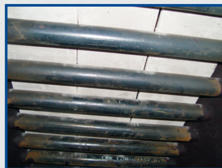
Firebox Watertubes Standard